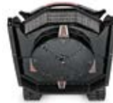
This blade-carrier style applies to RS72 only.