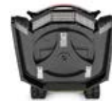
This blade-carrier style applies to both RX72 and RX84.